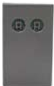
FMT-102ANL, FMT-202MSNL, FMT-202DANL